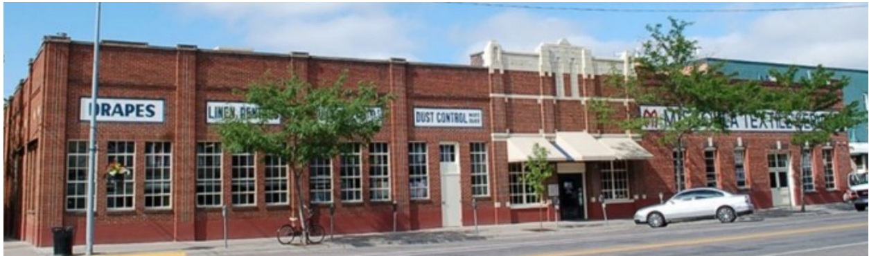
Bicycle Hangar (Store Signage - Painted May 2019)