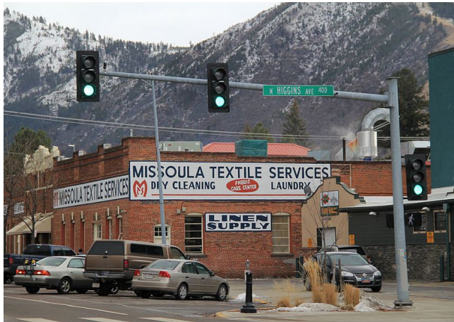
Missoula Textile Services