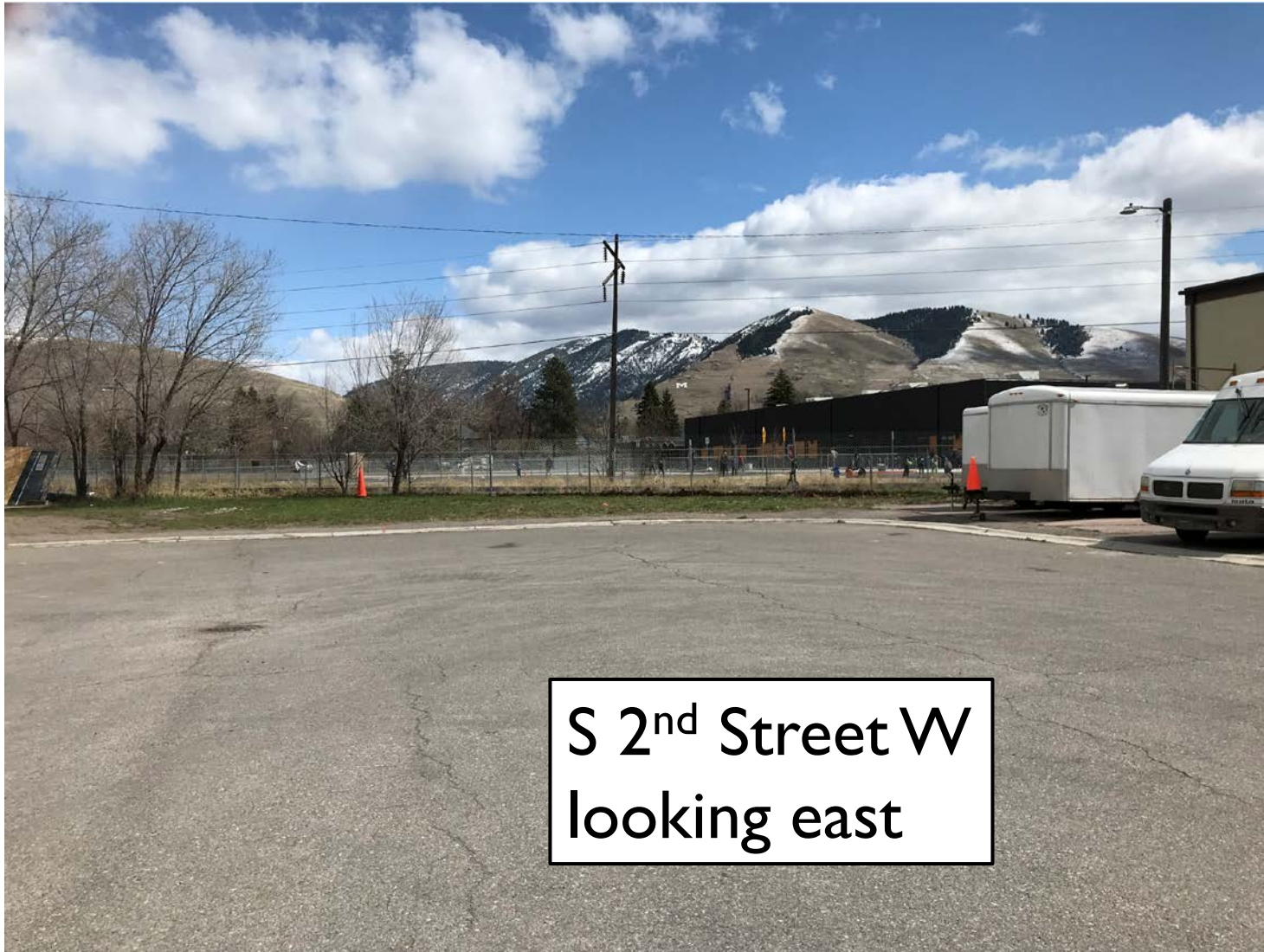
S 2 nd Street W looking east