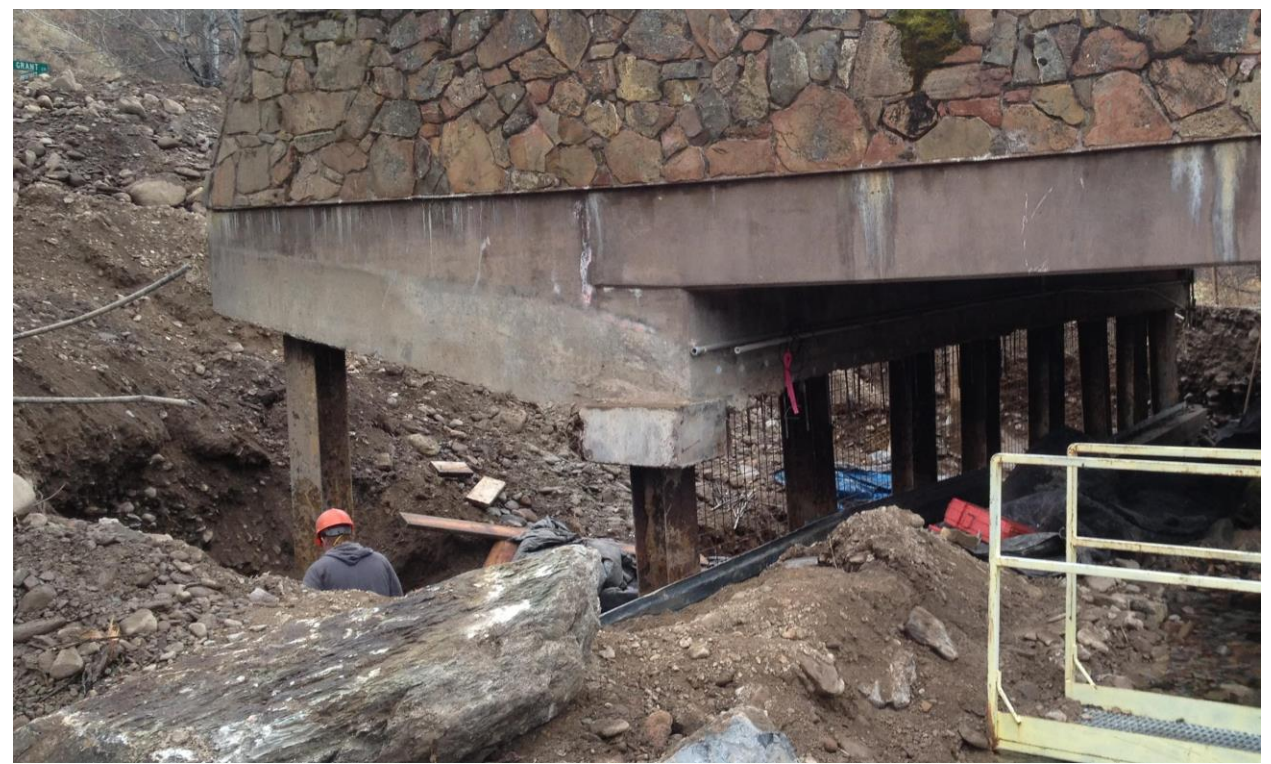
Figure 2—During the fall of 2012, Prospect Drive had to be closed while damage from the 2011 flood could be repaired. This was the first time residents of the Prospect and Prospect Meadows neighborhoods needed emergency access/egress but it may not be the last.