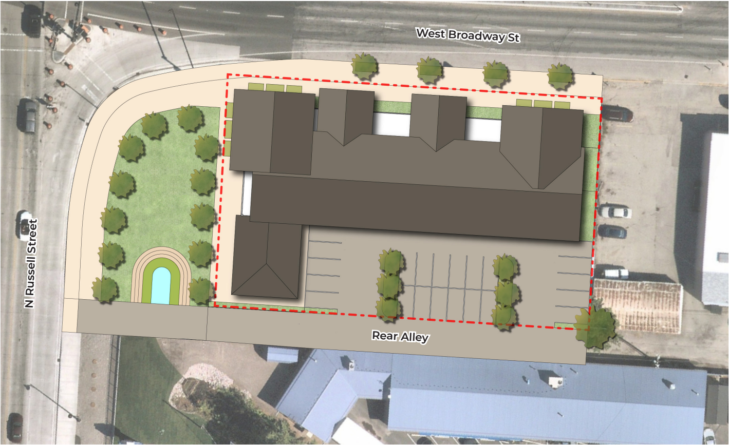
Conceptual Development Site Plan