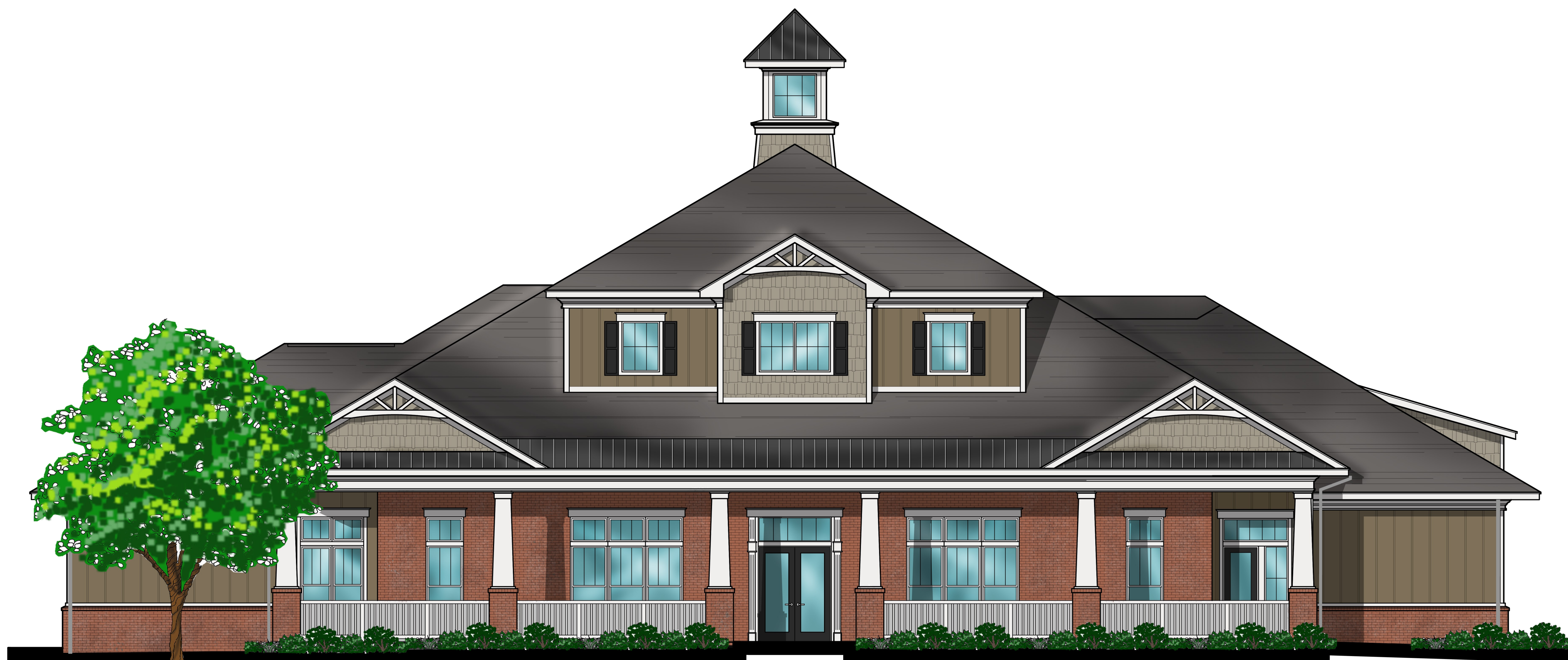
Clubhouse Conceptual Elevation