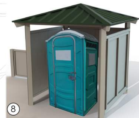
Portable Toilet Enclosure and Changing Station