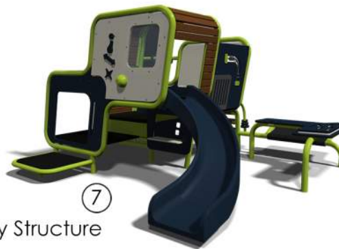
Cube Play Structure