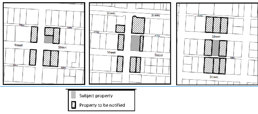
Figure 20.85-1 Example notification areas

Creating a new sub section for notice in the Review and Approval Procedures chapter will consolidate all notification process into one location. The colocation will include a quick reference table, will help with consistency across the regulations, and will clarify process and timing. An intent statement has been added. The requirement to notify owners within 150' of a proposed project will be made consistent. Staff will continue to notice surrounding parcels regarding a tourist home, but applicants will not be required to notice them.